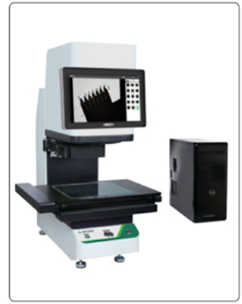
11.6" LCD (optional)