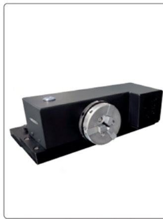
rotary table (optional)